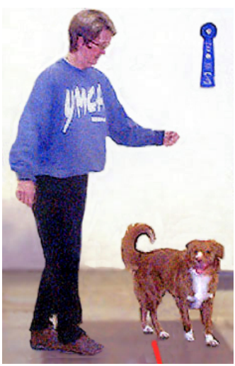
Handler is backing up from the right side of the mat to the left to return. Dog went away and will return on the red line.

When you get to the end of your mat (this is the complicated part), stop, then back up to your left until you're on the opposite side of the mat, facing back the way you came. Find another eyetarget, and go back to the beginning. Your left hand at shoulder height out from your body followed a path down the centre of the mat both going out and coming back. Wow! You're a star! Notice that if you'd had a dog on a leash, the dog would have been able to walk straight up the centre of the mat, and straight back down the centre of the mat, without zigzagging at all. Or at least, if you practised this a few more times by yourself, that's what could happen!