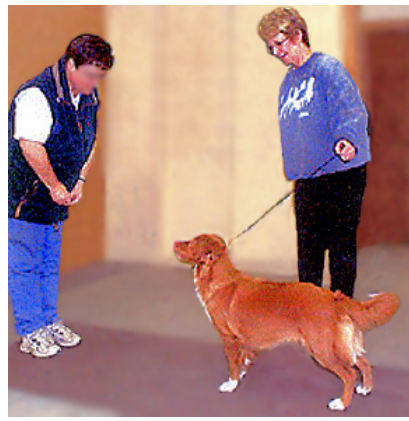
Very nice. The dog is responding to the judge after meetig the leash and using it to walk into a pretty stack.

treat, then begin slowing her down with the leash before she gets there so she can stop and make eye contact with him from a bit of a distance in order to get the treat.