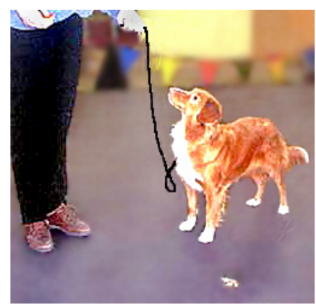
Excellent attention in spite of (or because of) bait on the floor, very loose leash. Zen at its best!

You've ben teaching your dog to do the conformation behaviours without the leash. When you put the leash on her, remember that she can already do the behaviours. You don't have to use the leash to keep her with you, to make her start, stop, or turn around, to