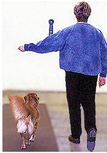
Handler is off the mat, dog centred correctly on it. The blue ribbon is the handler's eye-target.

are, don't look at your pretend dog, just keep your eye on the target. This is a great hint for laying scent tracks in a straight line, too, in case you were interested.