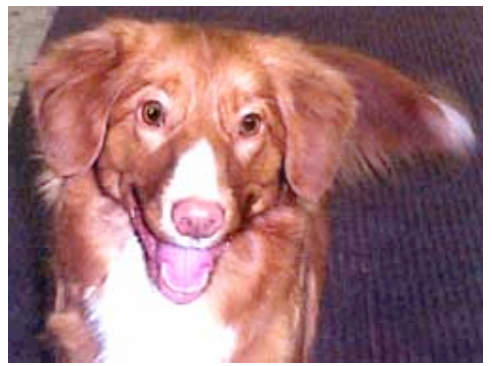
My best smile, my happiest tail. Now how about that ribbon?

And if you ride, you know that "the proof of the training is in whether the horse becomes more beautiful because of it". Conformation handling is a dance. You lead the dance, but the object of the dance is for you to be invisible and for your partner to be smooth, natural, and stunningly beautiful. When people start congratulating you on having such a "great natural show dog", you'll know that all those hours of training have paid off.