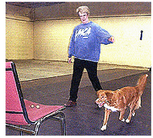
Superb trot, eyes on the prize. Note the invisible leash! This is a trot: left front and left rear legs are coming together, right front and right rear legs move apart. The back is flat, the tail correct, expression is cheerful and alert. This is excellent.

Another factor in the circle that you'll be paying attention to will be how far the dog is from you. She needs to be close enough that you're moving together, yet she should be slightly ahead of you and far enough from you that she appears to have her own personal space and integrity. Another reason for your left hand out from your body at shoulder height - if the dog's spine between her hips is centred under your outstretched hand, she's probably in a perfect gaiting position. The leash between your hand and her neck isn't pulling her off to the side and throwing her gait off. Take another look at the picture above - the position is perfect. The dog is directly under the handler's outstretched hand and a bit ahead, and appears to be totally in control of what's happening, while the handler appears to be "along for the ride".